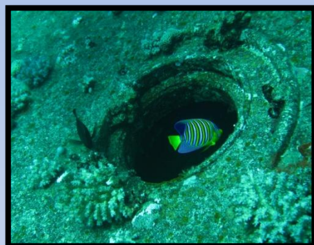
Sea life on the wreck of the Salem Express