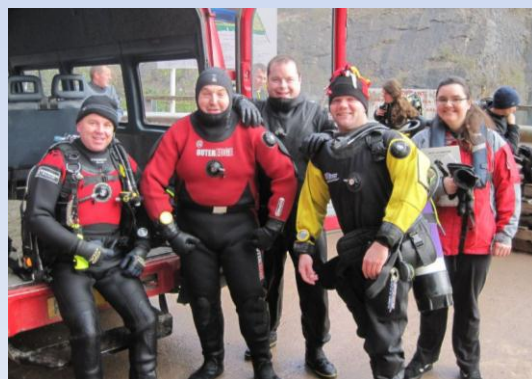
Dive Leader Training at NDAC 2/12/12

On Saturday 12 th January 2013, the four Dive Leader trainees will be participating in a Lift and Shift day. This will likely be held in West Wales (weather dependent). Keep an eye out on your emails, as plans will be confirmed a week prior to this.